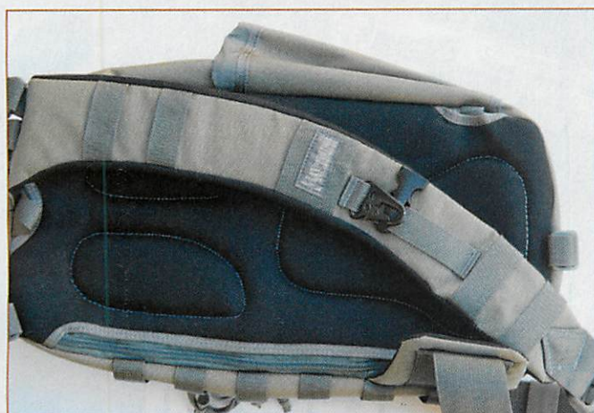
Rear of Sitka Gearslinger showing wide contoured padded shoulder strap and padded back side.