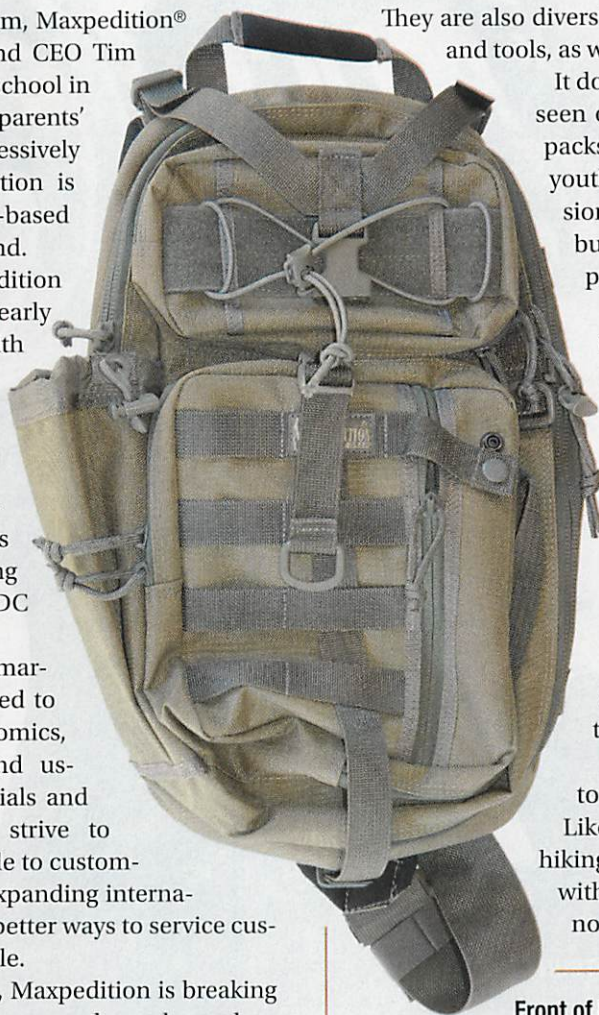
Front of Maxpedition Sitka Gearslinger pack.

I recently had the opportunity to evaluate the Sitka™ Gearslinger. Like the Fatboy, the Sitka is great for hiking or just having emergency items with you in a vehicle. The first thing I noticed was this pack is similar to a